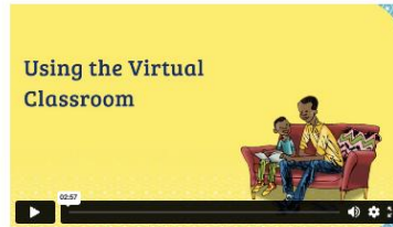
See how to support your child at home with our Virtual Classroom.

We support our schools to work in partnership with you at home. This includes books for home reading, information booklets and a Virtual Classroom with films for children to practise.