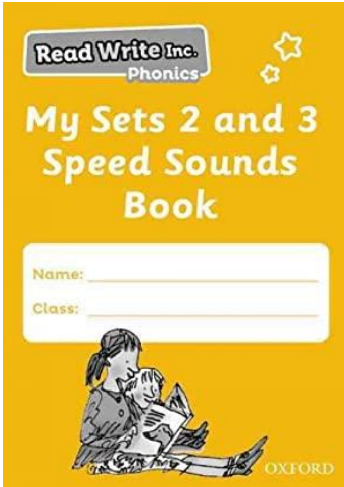
My Sets 2 and 3 Speed Sounds Book