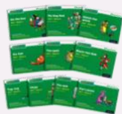
Read Write Inc. Set 1 Green Storybooks Colour