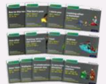
Read Write Inc. Set 7 Grey Storybooks Colour