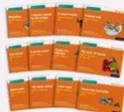
Read Write Inc. Set 4 Orange Storybooks Colour