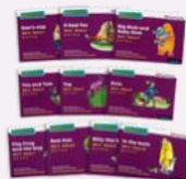
Read Write Inc. Set 2 Purple Storybooks Colour