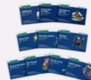
Read Write Inc. Set 6 Blue Storybooks Colour