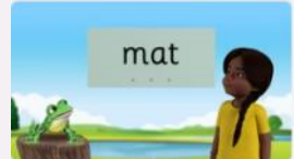
Word Time 1.1