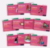
Read Write Inc. Set 3 Pink Colour Storybooks