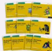
Read Write Inc. Set 5 Yellow Storybooks Colour