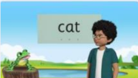
Word Time 1.3