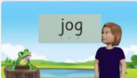
Word Time 1.5