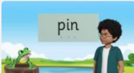
Word Time 1.2