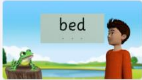
Word Time 1.4