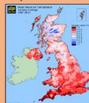
Average summer temperatures in the UK