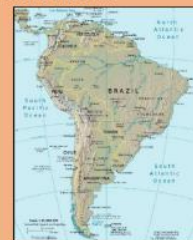
Physical map of South America