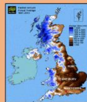
Average precipitation across the UK