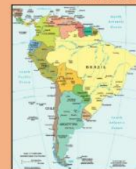
Political map of South America